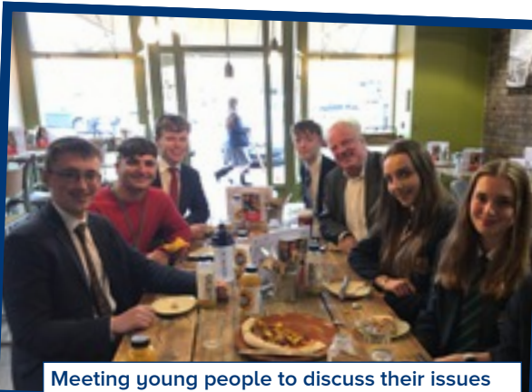
Meeting young people to discuss their issues over pizza.

Schools, more than ever, need to be at the forefront of our Governments thinking. We are investing in our children's futures with the biggest funding boost for schools in a decade - £14 billion additional funding over the next three years - meaning more money for every child to receive a truly world-class education. For Lincolnshire this means £4,688 per pupil, an increase of 5.72%.