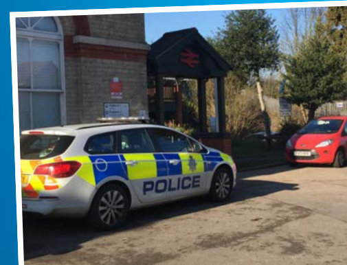
A police car at Lea Road Station.