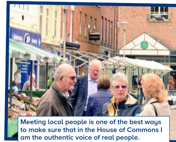
Meeting local people is one of the best ways to make sure that in the House of Commons I am the authentic voice of real people.

Whether on windfarms or roads or schools, I constantly argue the case for local decision making and fairer funding for our county and strong controls on new housing.