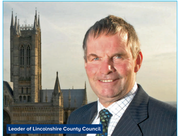
Leader of Lincolnshire County Council

The alternative is local politicians who are disunited, less committed, backwards looking and incapable of accepting the financial realities or how to address them.